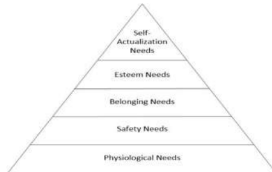
Figure 1. Maslow's Hierarchy of Needs and Motivation

on motivation is tailored by Abraham Maslow (1943) which is known as Maslow's hierarchy of needs and motivation. Maslow stated that there are five basic needs of human that is considered basic which are, in sequence, physiological, safety, social, esteem, and self-actualization.