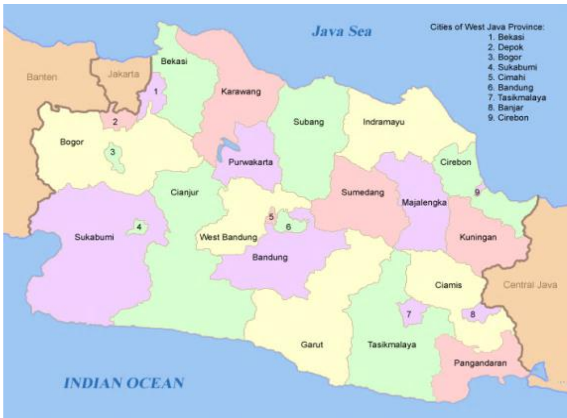
Figure 2. Administrative Map of West Java Province [4].

The Ministry of Tourism has been offering many options of tourism office websites in 33 provinces of Indonesia as a research data. This study will focus on an evaluation of the tourism website in West Java province. The samples are 18 regencies and 10 cities in the administrative area of West Java province (Fig. 2).