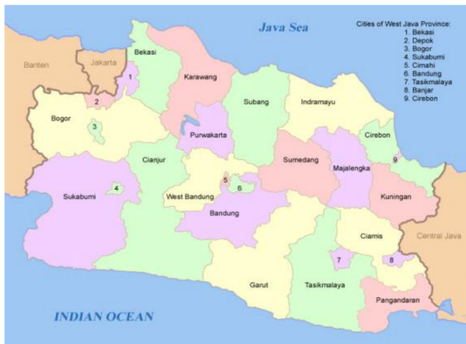
Figure 2. Administrative Map of West Java Province [4].

The Ministry of Tourism has been offering many options of tourism office websites in 33 provinces of Indonesia as a research data. This study will focus on an evaluation of the tourism website in West Java province. The samples are 18 regencies and 10 cities in the administrative area of West Java province (Fig. 2).